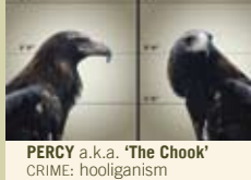
PERCY a.k.a. 'The Chook' CRIME: hooliganism

14 WEDGETAIL ESTATE ADDRESS: 40 Hildebrand Rd, Cottles Bridge (Mel 263 E1) PHONE: 03 9714 8661 EMAIL: info@wedgetailestate.com.au WEBSITE: www.wedgetailestate.com.au