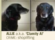
ALLIE a.k.a. 'Clarity AI' CRIME: shoplifting

6 LOVEGROVE VINEYARD & WINERY ADDRESS: 1420 Heidelberg-Kinglake Rd, Cottles Bridge 3099 (Mel 263 K1) PHONE: 03 9718 1569 EMAIL: enquiries@lovegrovewinery.com.au WEBSITE: www.lovegrovewinery.com.au